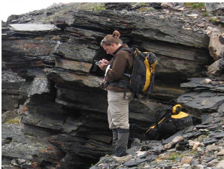
Researcher recording observations at a bedrock outcrop

Come visit us at Sambaa Deh Campground on Saturday, August 23 to see some fossils and learn more about our work! If you have any questions or concerns contact: