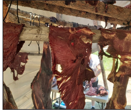
Photo of our Dry Meat At our August 2022 Healing Program

We continue to work with federal funds and projects to support the development of our vision, implement various initiatives and support community initiatives. We have received funds for mental wellness, a regional mobile wellness team, COVID-19, and we planning a regional Patient Advocate project and expanding midwifery and doula services in partnership with the Northern Birthwork Collective.