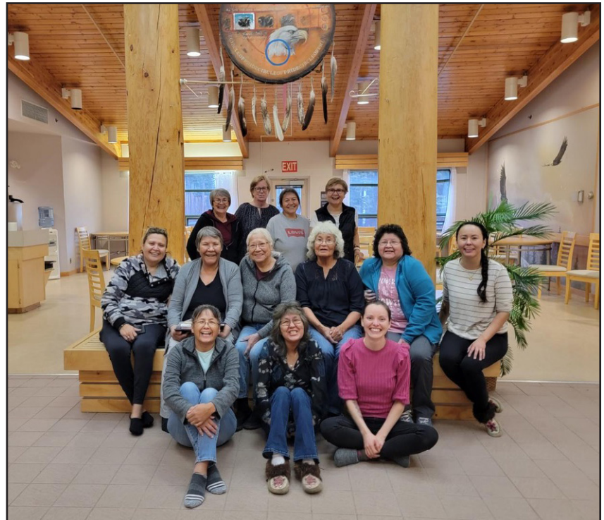
Photo: Dehcho Regional Health & Wellness Working Group Meeting, in October 2022, in Katlodechee at the Dene Wellness Center.

W e are excited to share the latest updates from the Dehcho First Nations Health and Wellness Division.