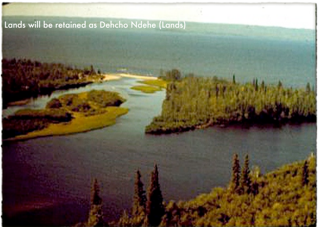
Lands will be retained as Dehcho Ndehe (Lands)

This is a big concern for leaders. Many people have tax arrears. Changes to the existing taxes will have to be negotiated. It will be up to the new community governments to decide if they will impose property taxes.