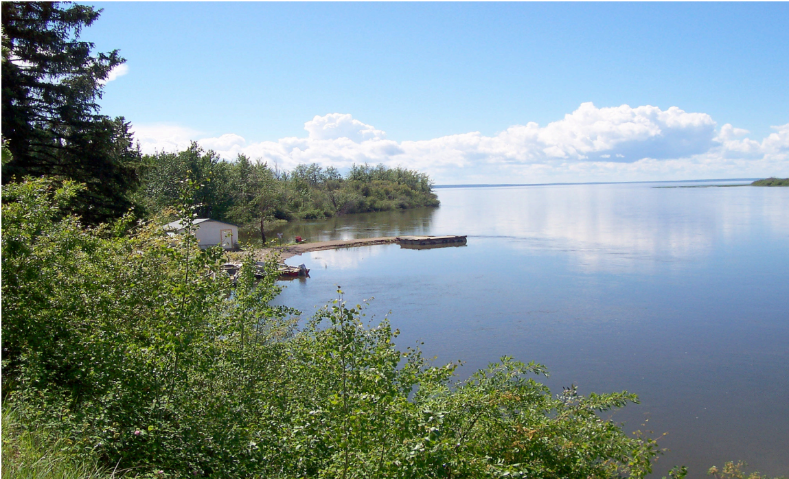
Summer in Kakisa