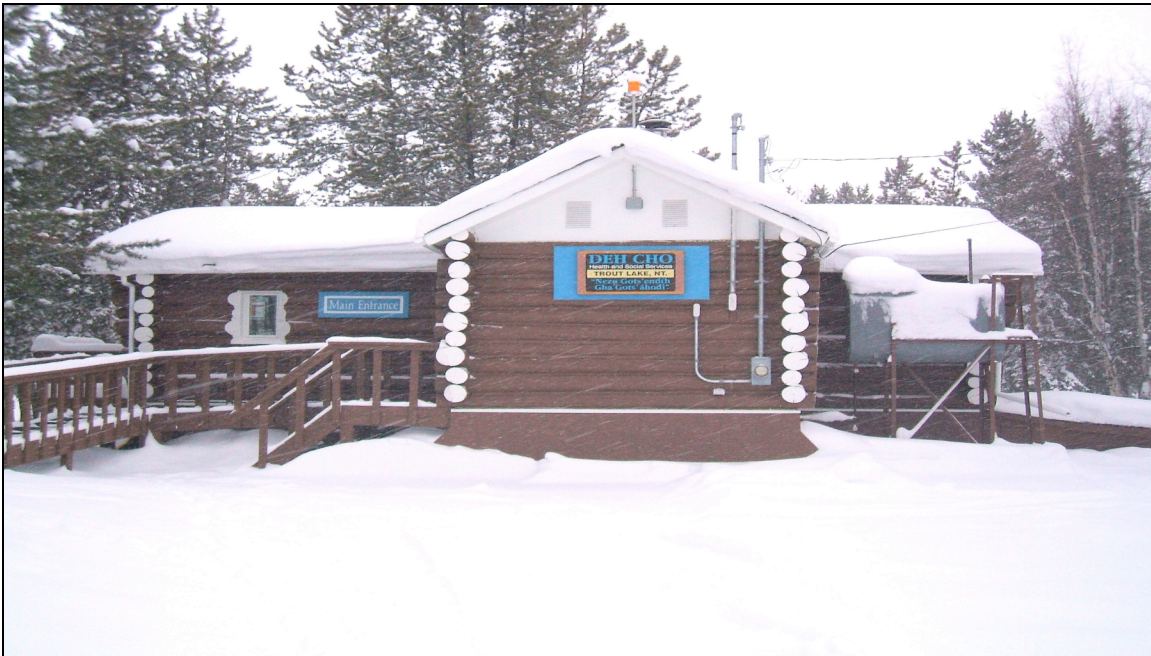
Trout Lake Medical Clinic