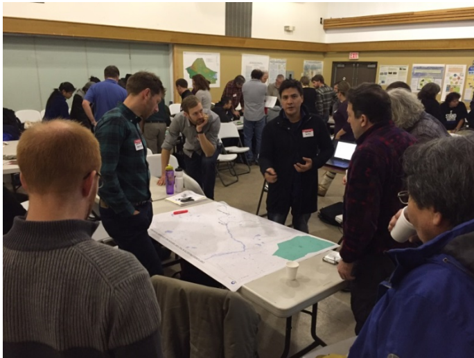
Participants discussing the Mapping Exercise

During the evening of Day 1, workshop participants and the general public had the opportunity to attend an Open House to discuss various environmental research and monitoring projects in an informal setting while enjoying some local musical talent, beading and crafts, and light refreshments. Over 50 people attended the Coffee House/Open Mic night with all proceeds going to the Open Sky Creative Society.