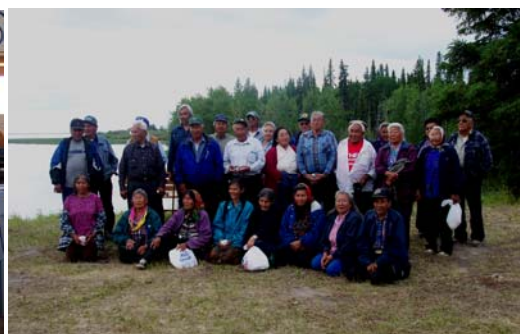
Elders gathered for a group photo during