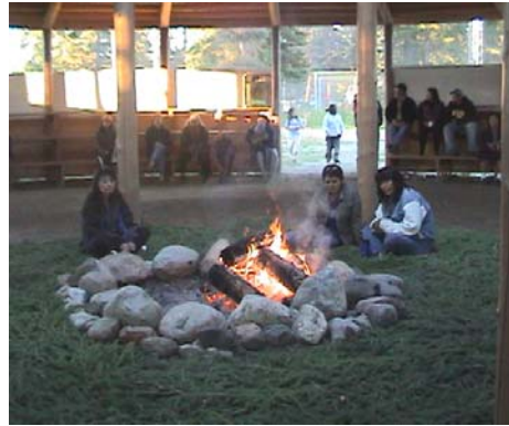
Around the campfire at Kakisa Assembly.

"Strong, proud, happy people through self-government and sustainable economic development while maintaining the integrity of land and Dene/Metis traditions."