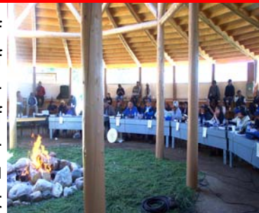
DCFN's Annual Assembly in Kakisa— June 2004

The assembly was not all work and no play. AFN Regional Vice-Chief, Bill Erasmus, presented the chiefs with Assembly of First Nations jackets and included MP Ethel Blondin-Andrew. There were nightly drum dances with drummers from all the participating communities. One night twenty-three drummers performed at one time which was an amazing sight to behold. A youth talent show was held on June 30th and was followed by the adult talent show on July 1st. The arbor was packed for the adult talent show with visitors from as far away as Yellowknife. There were many talented individuals - both young and old who were truly deserving of the accolades that flowed their way. A good time was had by one and all.