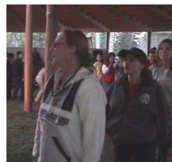
DCFN staff at a drum dance at Kakisa Assembly

This year there was a large youth delegation. They had their own “breakout session” and brought forth many innovative and unique ideas. These young people are obviously well on their way to becoming informed and involved individuals who would certainly one day be a credit in our struggle to govern ourselves.