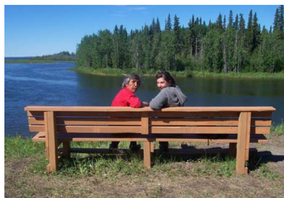
Taking a break at Kakisa Assembly.