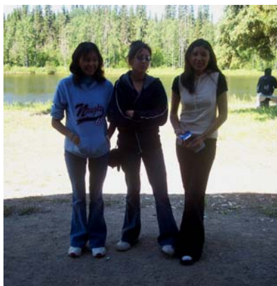
Youth delegates at the Kakisa Assembly.