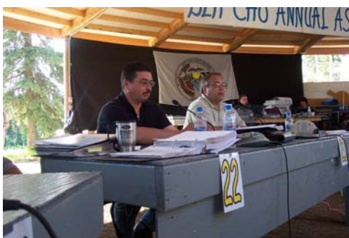
DehchoMLA Michael McLeod and Premier Joe Handley at 2004 Kakisa Assembly