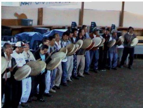
Drummers from various communities at a Kakisa drum dance. There were 23

Young Girls and Boys Should Behave Respectively