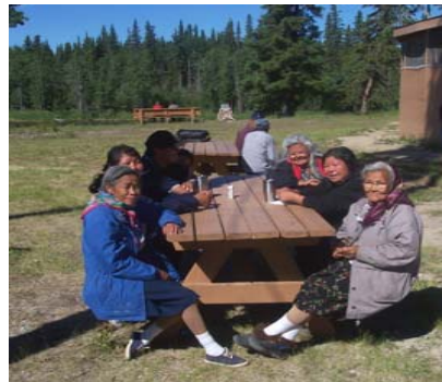
Fort Providence delegates at the 2004 assembly in Kakisa.