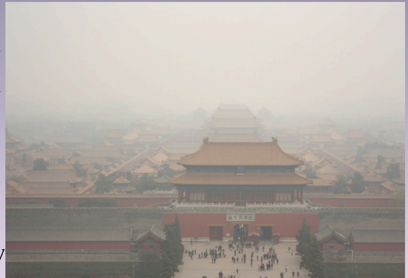
Smog in China